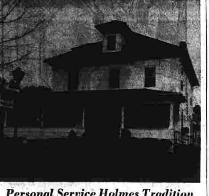
Personal Service Holmes Tradition to make your festivities even more Scotch is a most popular lig So many people have appreciat a most popular liquid and at the 6 and 44 Package Sto

Manhers How York Stock Exchange 913 Main Street. Manchester - Mitchell 3-1571